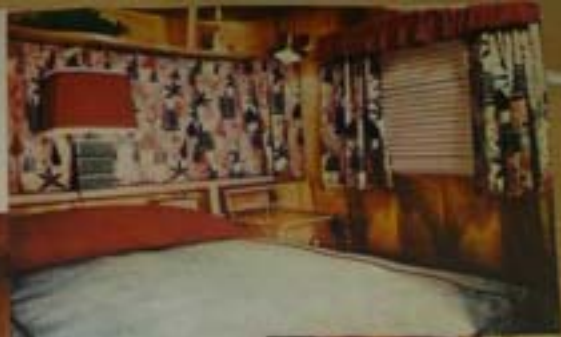
Bedrooms either with twin or double beds . . . good ventilation beds and furniture made by Spartan.