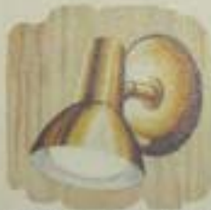
Highest quality wall light fixtures . . . adjustable.