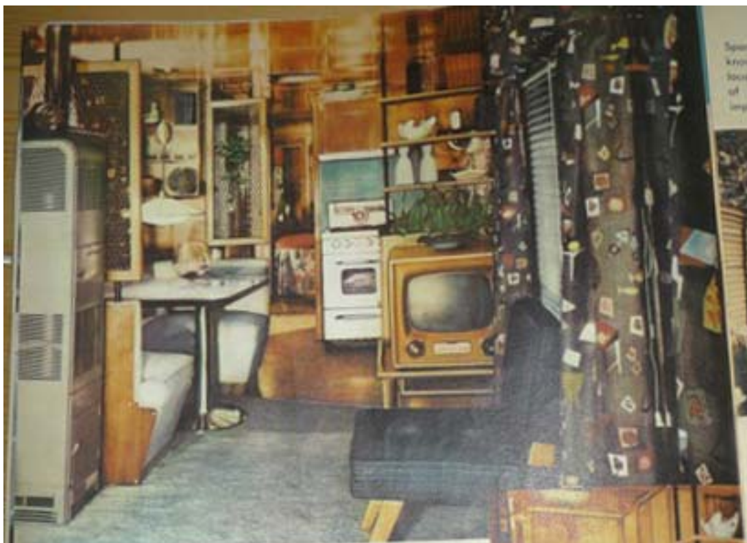
Spartan kitchens feature of the largest