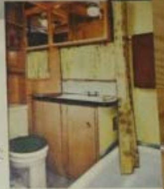
Shower, tub, lavatory, flush toilets in all Spartans.