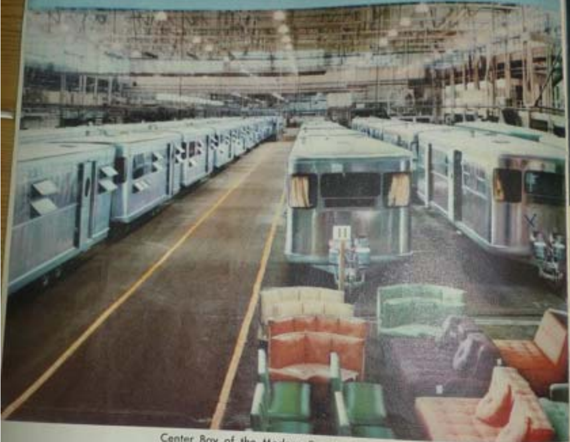
Center Bay of the Modern Spartan Factory