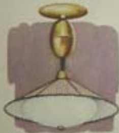
Modern, adjustable light fixtures . . . matching finish.