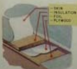
Ceiling design and insulation . . . heat penetration held to a minimum.