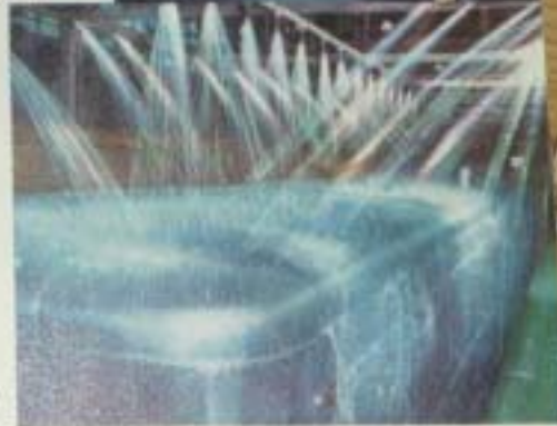
All Spartans are leak-tested all over.