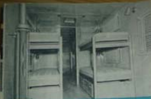
Living quarters for work crews