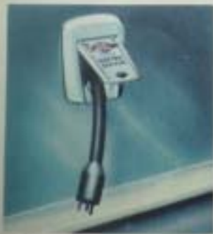
All wiring in conduits and safety-grounded.

Spartan maintains its distinctive appearance by exterior casings made on this huge hydraulic press.