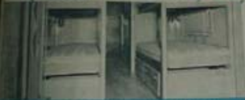
Living quarters for work crews

Pay for your new Spartan through any authorized Spartan Homes Dealer. As little as one-fourth down with up to five years to pay and only five percent yearly finance charge makes the Spartan Plan the best financing plan. And, remember, this payment includes both your mobile home and all your furniture and appliances. Spartan Homes are the finest in the world . . . equipped with famous-name appliances and Spartan-made and Spartan-guaranteed modern furniture . . . Just one low payment covers all. Home, protection and furnishings.