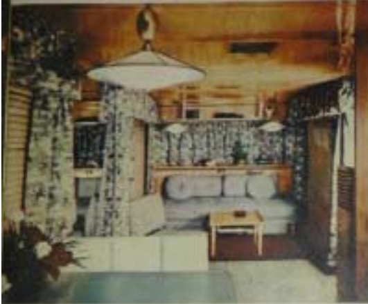
Long-life, dual purpose divans made in the Spartan factory are of the highest quality.

Spartan Interiors are designed by nationally-known experts . . . the floor-plan and cabinet locations evolve from experience with thousands of Spartan Mobile Home users who helped improve Spartans.