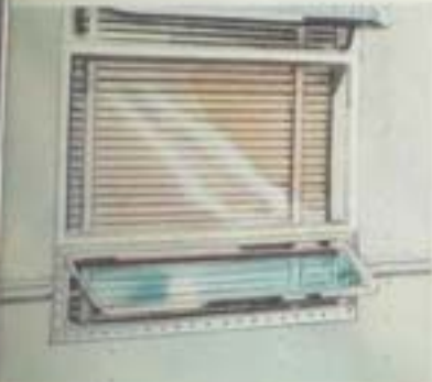
Spartan-designed windows . . . water-tight, yet comfort-zone ventilation.

Spartan maintains its distinctive appearance by exterior casings made on this huge hydraulic press.