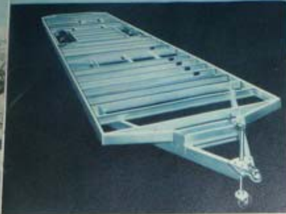
The foundation . . . Spartan's all-steel, all-welded perimeter frame.

All-aluminum, all-riveted construction . . . aircraft design throughout for strength, good appearance and long life.