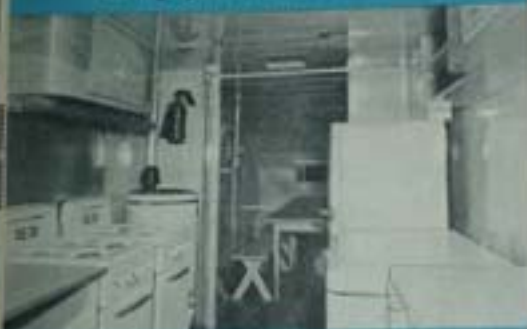
Mobile kitchen and dining room