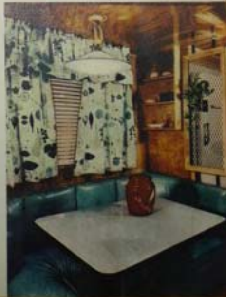
Diets designed for comfort and convenience . . . good ventilation.