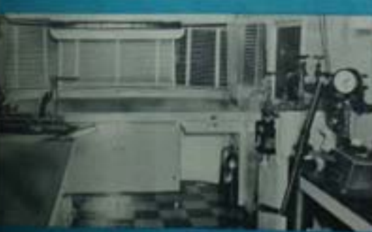
Work shops on location